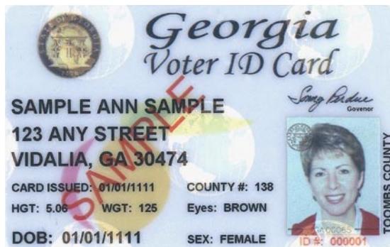
Example of a Georgia Voter Identification Card

If you have moved, you must update your voter registration by submitting a new application.